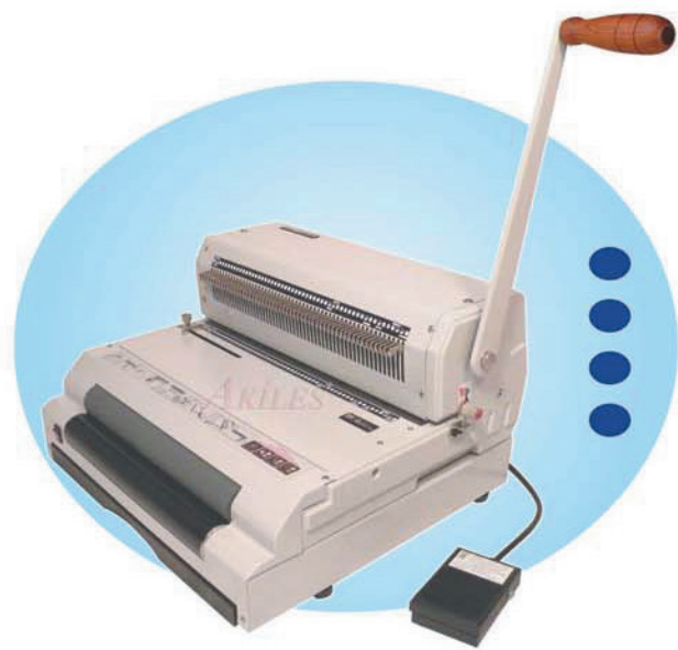
CoilMac-ECI+ (PLUS version)