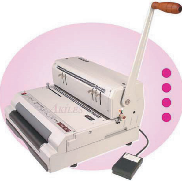
CoilMac-ECI (STANDARD version)